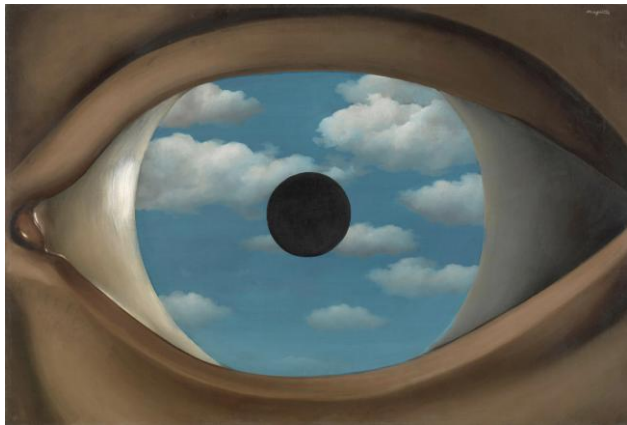
René Magritte The false mirror [Le faux miroir] 1929, Museum of Modern Art, New York