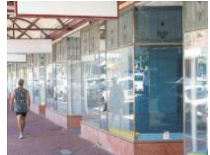
Shopfronts before they were boarded up.

Developer Sanur is seeking approval from the State Administrative Tribunal to demolish a row of 1921 shopfronts on Hay Street, Subiaco, citing structural unsafety. This claim is being hotly disputed. The developer has owned the buildings since 1989. It is unknown when SAT will make a decision. Read more in the Post Newspaper.