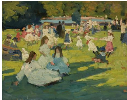
Ethel Carrick, Esquisse en Australie [Sketch in Australia] 1908, National Gallery of Australia, Kamberri/Canberra, Purchased 2023

Naala Nura, our south building 26 October 2024 – 9 February 2025